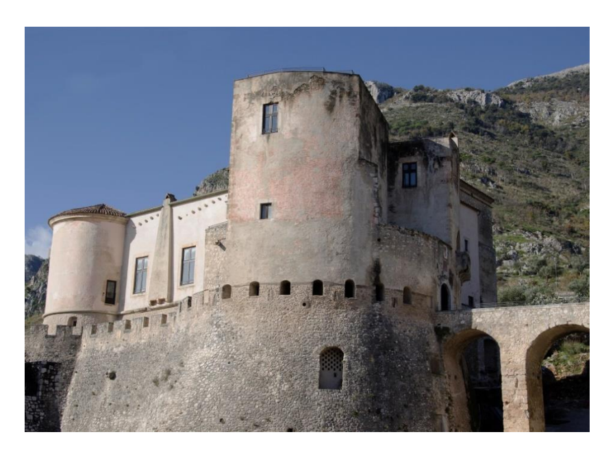
Fig. 2 – View of the castle.

a wider defense battlement, built on the opposite side of the towers and the curtain interposed on the southeastern side with a covered walkway; rectangular or crossbow slits were added to the circular slits for firearms. For residential and representative needs, some rooms were widened and ornamental architectural elements were added to enhance the appearance of the building: the construction of the lodge at the entrance of the second floor dates back to the time of Enrico Pandone, on the model of the Sangallo and Bramante architectures; Count Enrico also built the terraced garden and added the significant cycle of frescoes (1521-1527) made up of the portraits of his favorite horses, which makes this place unique.