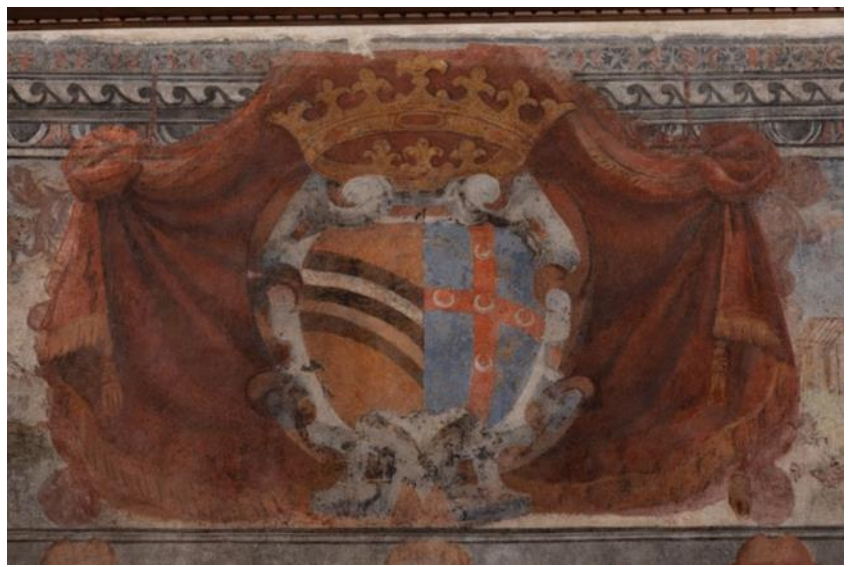
Fig. 7 - Coat of arms of the central hall that joins the coat of arms of Capua to that of Piccolomini.

the search for a greater monumental effect than the other rooms is evident. The horses are positioned at a higher height and, on the short sides, there are two horses, on the sides of the coat of arms. The captions of the horses date back to 1527, the last painted figure in the hall, just before the tragic events that brought Enrico to the gallows, in 1528. The decoration of the upper fascia that extends over the four walls is of a later period. At the center of each side of the frieze, there are the noble coats of arms of the Capua and other families. On the wall, towards the valley, there is an eighteenth-century decoration with painted frames, framing tapestries, which have been lost.