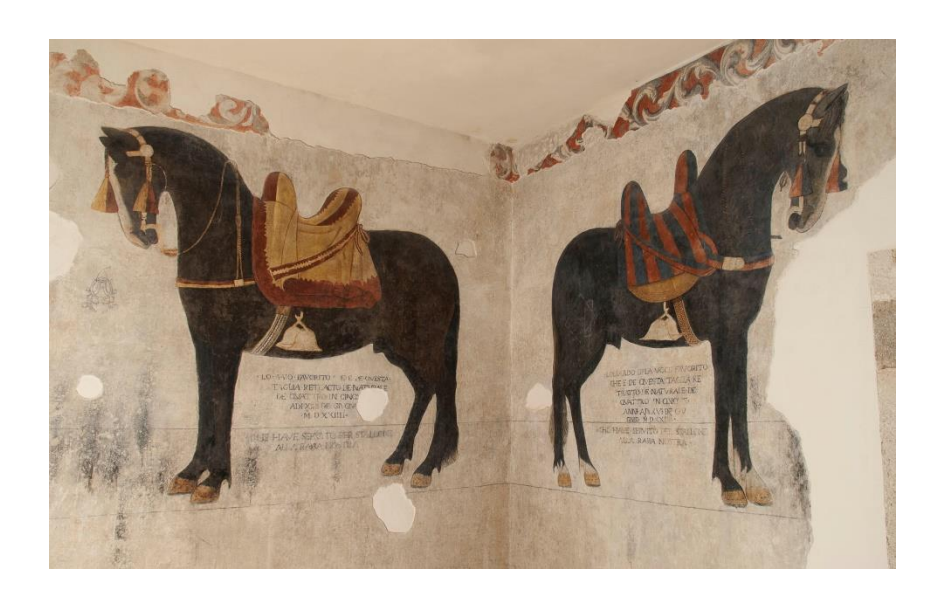
Fig. 5 – The horses of Enrico Pandone.