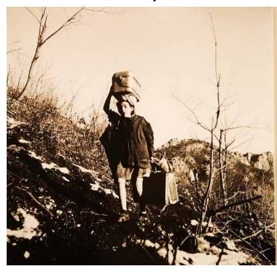
Room 9 - Robert Capa

The girl with suitcase -Diletta Photography Robert Capa (Budapest 1913-Thai Binh 1954)