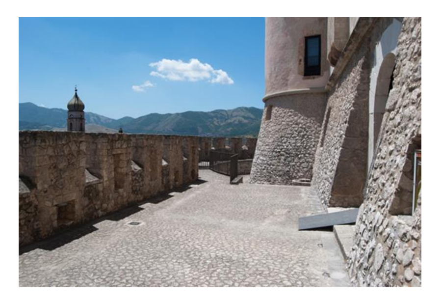
Fig. 4 – Walkway.

In 1922, the Duchess of Bruzzano sold it to Ercole Ferri. Since the 1930s the castle was divided into flats rented to modest families, and during the Second World War it served as a shelter for homeless people. In 1979, it was purchased by the Minister for Cultural Heritage, restored and finally open to the public. Since 2012 it has been home to the National Museum of Molise.