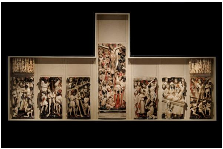
Room 1- Art and artists: churches, abbeys and castles

POLITTICO DELLA PASSIONE English shop (Nottingham) End of XV century, Alabaster.